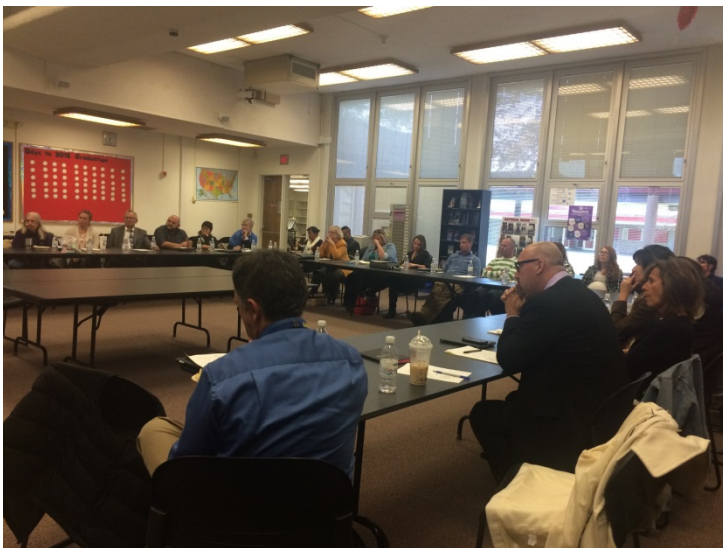
More than 30 people attended the Truckee Meadows Healthy Communities 89502 Planning Committee meeting in April of 2015. Renown has been heavily involved and served as a convener with the Truckee Meadows Healthy Communities 89502 project.